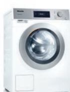
Little Giant PWM 507 [EL DV]