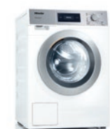
Evolution PWM 307 [EL DP]