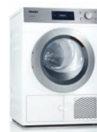
Evolution PDR 307 [EL]