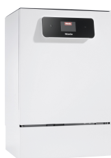
PWD8682 Washer disinfector

With each PWD8682 washer disinfector for dental practices, we include: